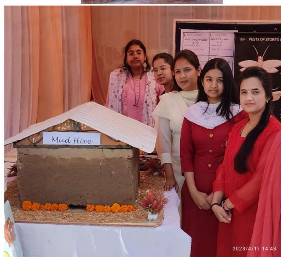
Exhibition of innovative agricultural practices and processes by various departments of Dr. Khem Singh Gill Akal College of Agriculture during Kisan Mela organized on 12-13 th April, 2023 at Eternal University, Baru Sahib, Himachal Pradesh.