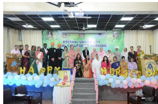
2023: Workshop on Pedagogical Initiatives