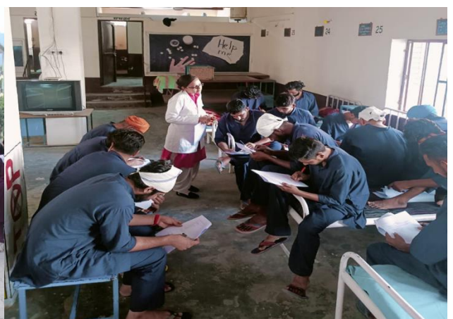
Caring of De-Addiction Patients