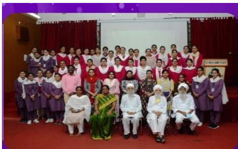
2021: Workshop on Research Methodology