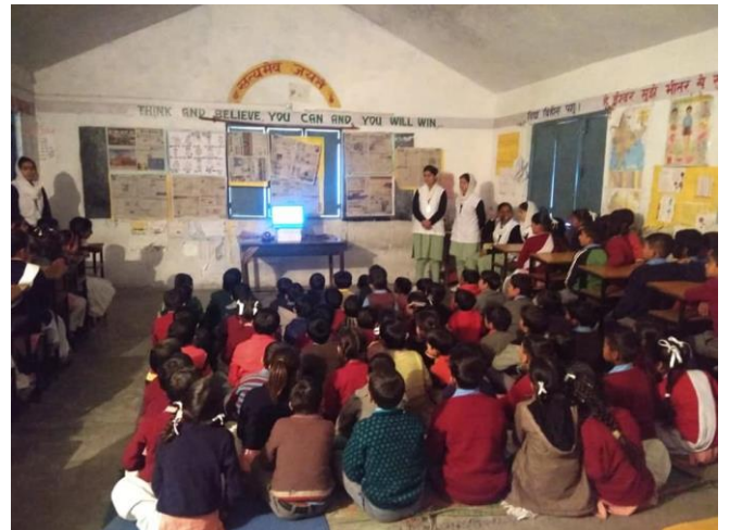
2019 GSSS -