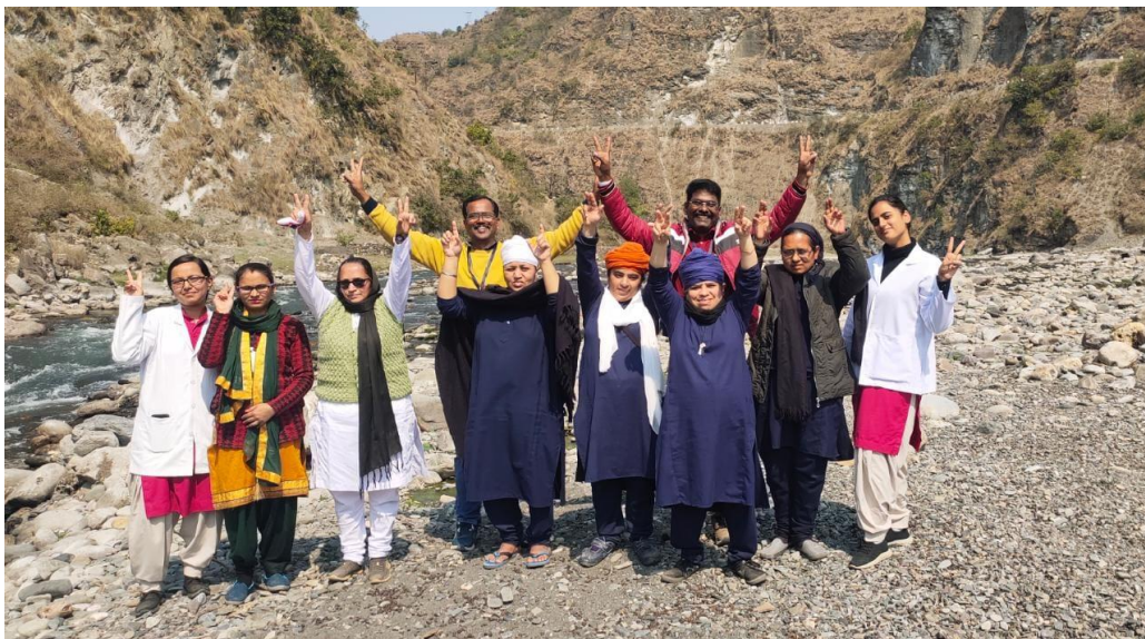
Caring of Psychiatry Patients