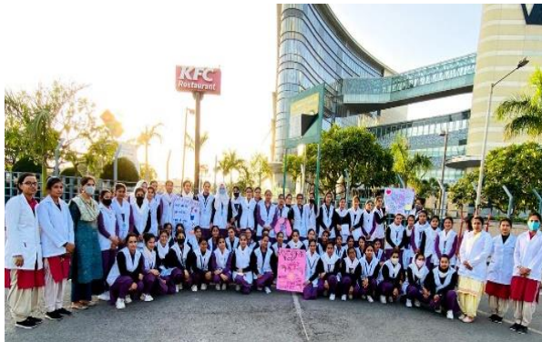
World Kidney Day