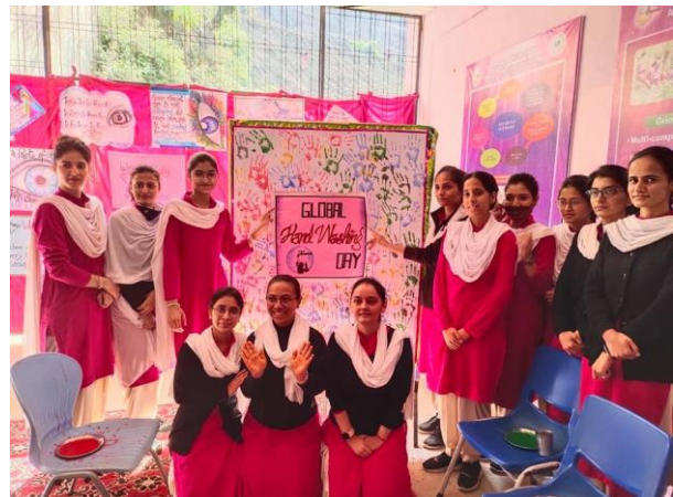
Global Hand Washing Day