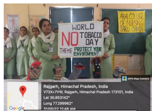
World No Tobacco Day