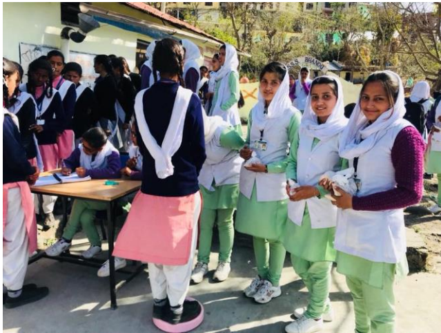
2018 GSSS - BHANOG