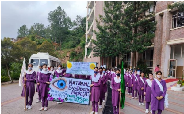
National Eye Donation Fortnight