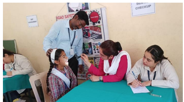
2023 GSSS – Sertendula