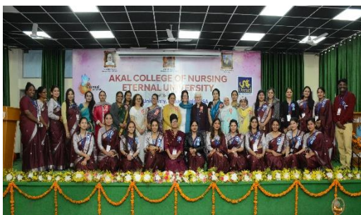
2022: Advanced Practices in Forensic Nursing