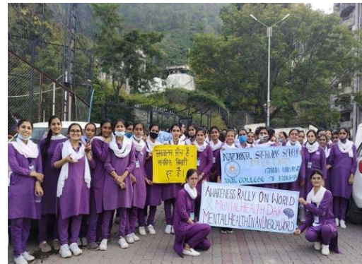
World Mental Health Day