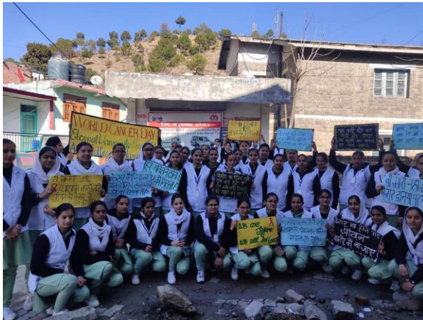
World Cancer Day