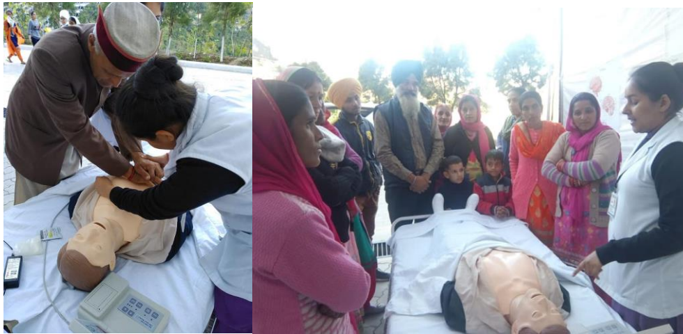
First Aid Training to Residents of Rural Village