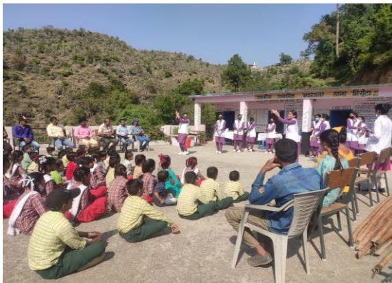
2020 GSC - Lanameu