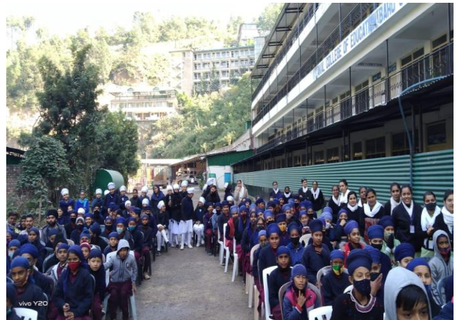
2021 Model School – Baru Sahib