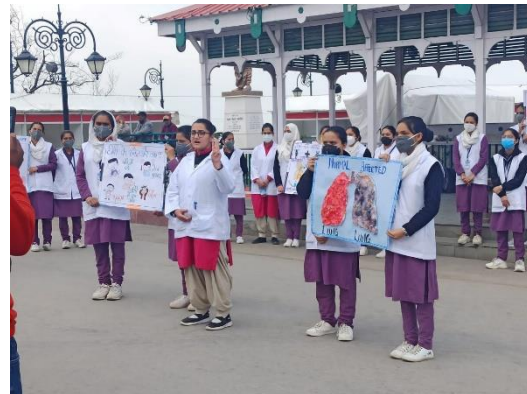
World Tuberculosis Day