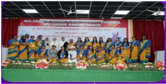
2018: Nursing Education & Practice : A Mental Health Perspective