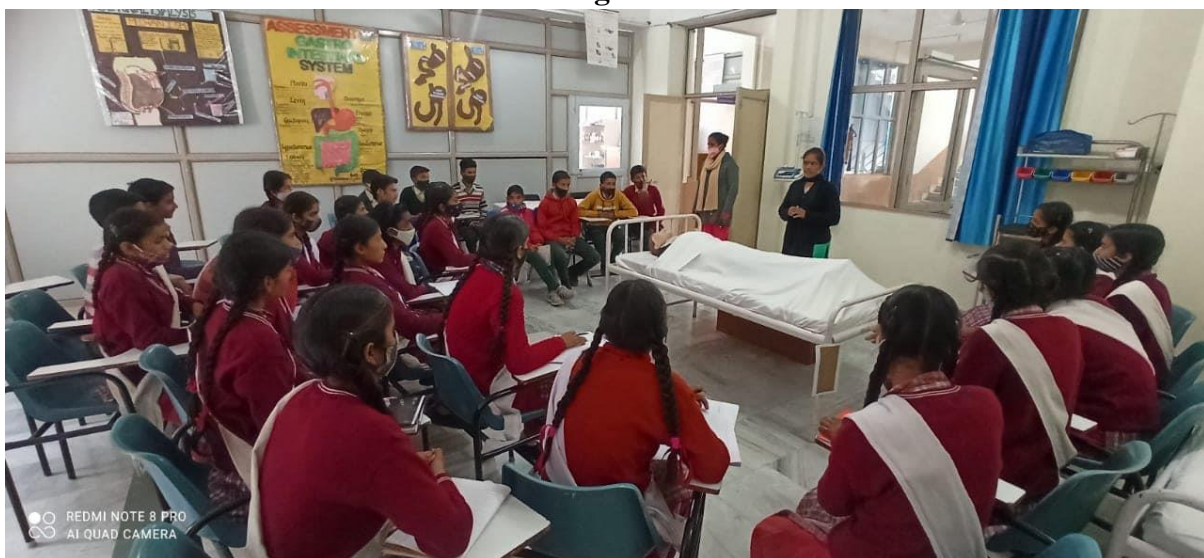
First Aid Training to School Childrens