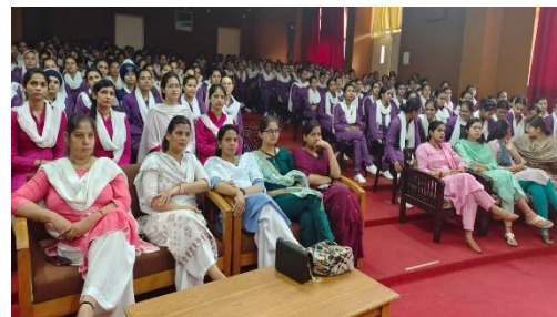
2022: Symposium on Breastfeeding Practices