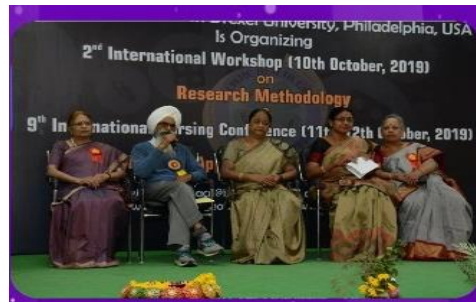
2019: Collaborative Approach for Holistic Health Care