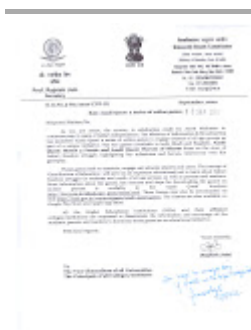
Azadi Quest- Notice.jpeg 656K