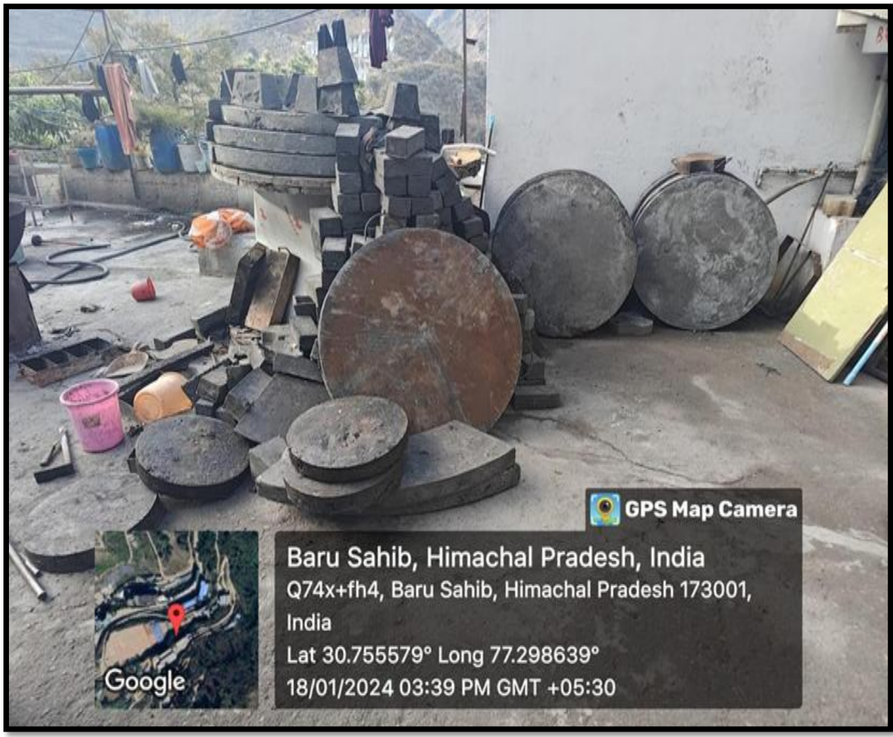
Waste recycling system