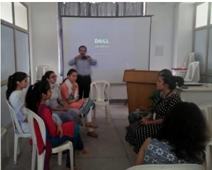
Glimpses of Quiz Competition