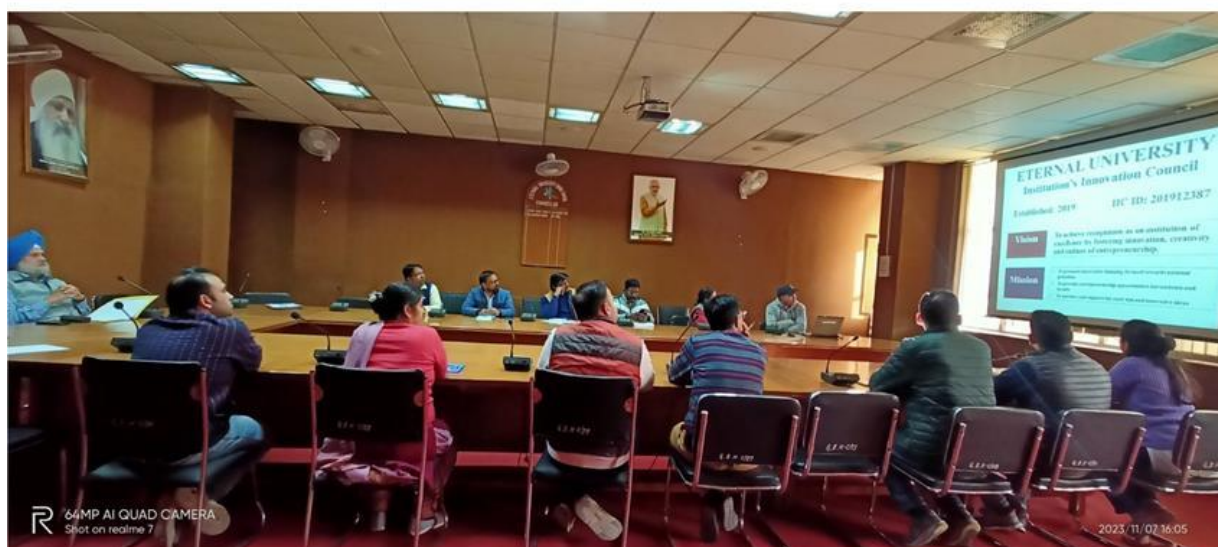
Quarterly meeting of Institution's Innovation Council held on November 07, 2023.