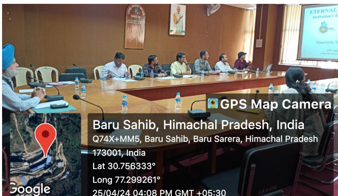
Quarterly meeting of Institution's Innovation Council held on April 25, 2024.